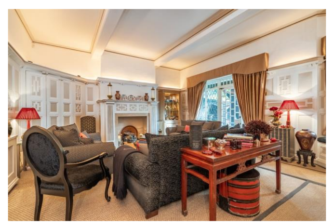
DRAWING ROOM: A stunning room with three quarter height panelling and imposing fireplace with wood surround and marble inserts. Discreet lighting, window seat, two radiators, folding doors leading to space for audio visual equipment and leaded light windows and doors to the rear garden.

INNER HALLWAY: Limestone flooring, stairs to the first floor, downlight, under stairs storage with built in bookshelves and radiator.