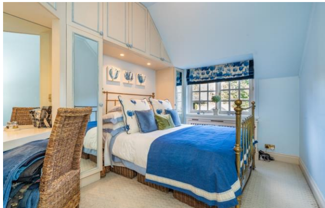
BEDROOM TWO: Window to the front, built in wardrobes and storage over the bed area, recess with built in dresser unit, radiator, downlights.

EN-SUITE BATHROOM: White suite of panel enclosed bath with mixer taps and hand shower attachment, low level WC and pedestal wash basin. Part tiled walls, radiator and electric shaver point.